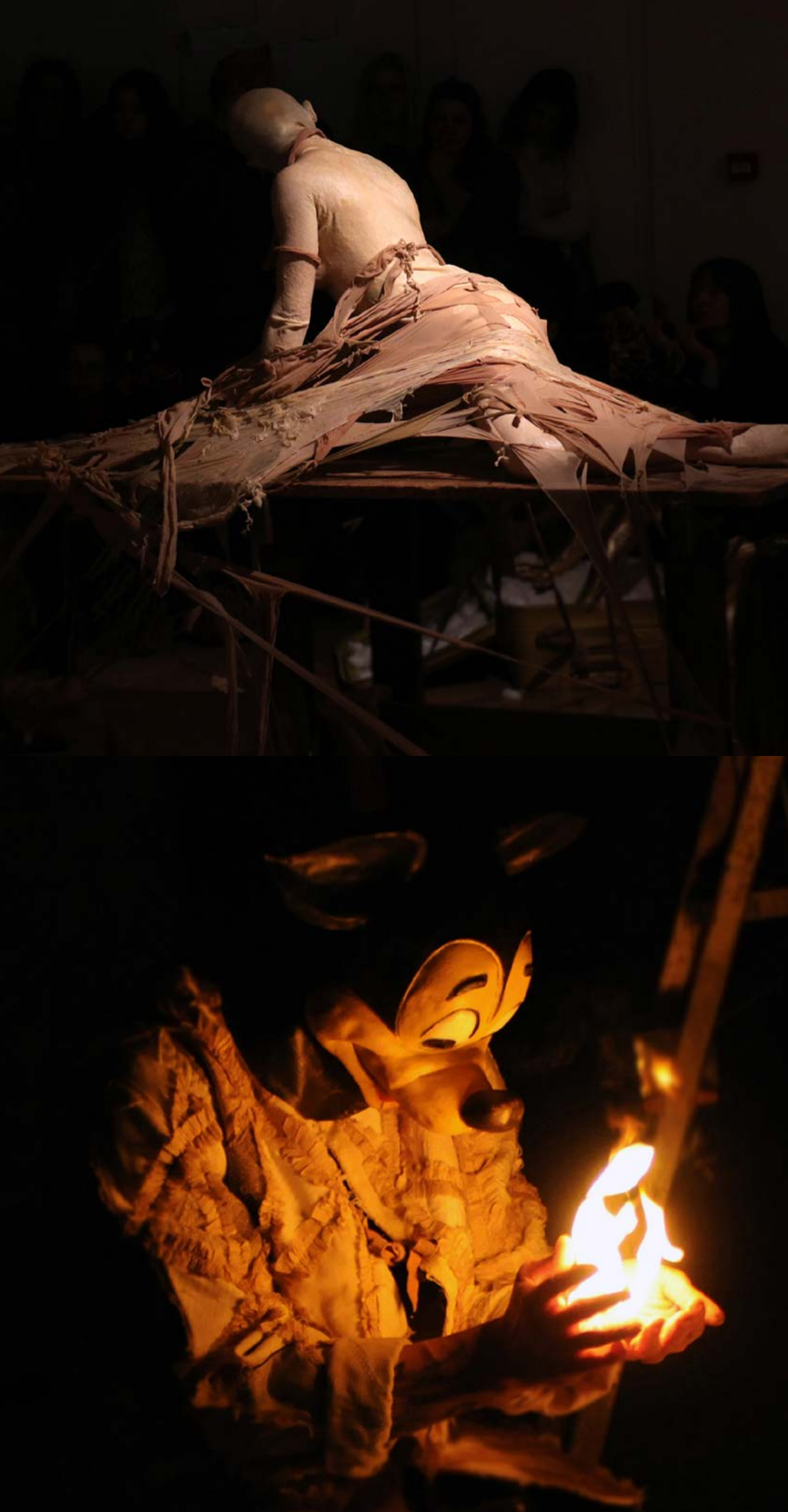
FIGURE 8 - VESTANDPAGE, HOME V: MOTHER (2018). NATIONAL GALLERY OF ARTS, SOPOT, PL