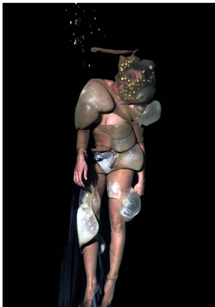
FIGURE 2 - VESTANDPAGE, DYAD I: BLACK AND WHITE (2014) HUB14, TORONTO, CA

For example, in the durational performance experiment about unfreedom and the struggle for freedom Without Tuition or Restraint (2011), Pagnes performed jailed inside a dog crate in the gallery space for five days and four nights consecutively (Figure 3 and 4). Stenke was free to perform around the cage (one durational action until physical exhaustion each day and night).