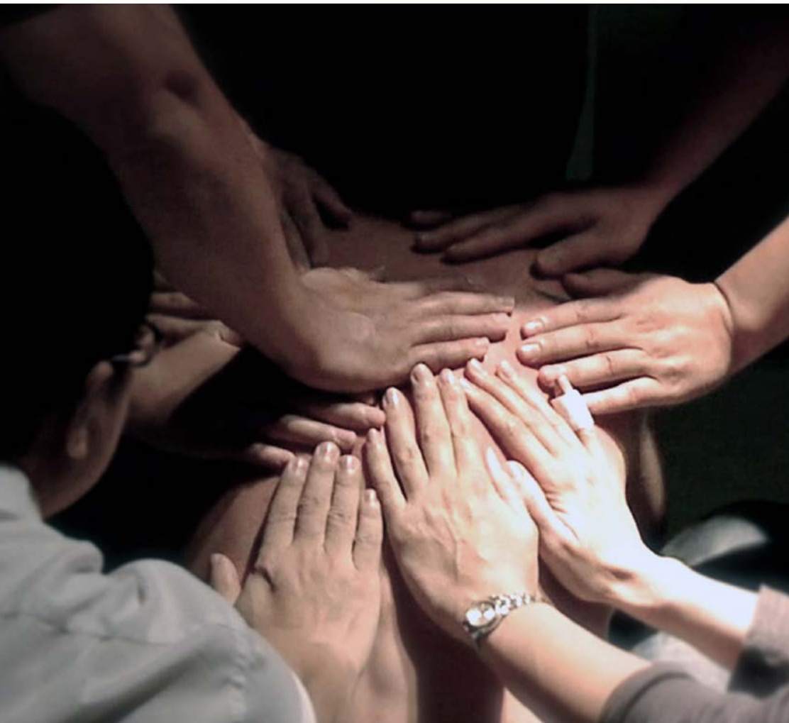
FIGURE 12 - VESTANDPAGE, PANTA RHEI V: Matter (2012). TAIPEI ARTIST VILLAGE, TAIPEI, ROC