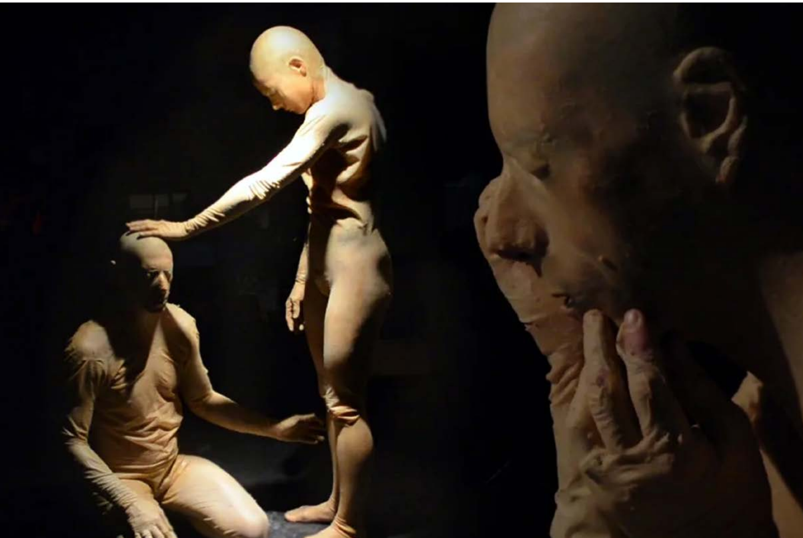
FIGURE 5 - VESTANDPAGE, DYAD IX: OPEN & CLOSED (2015). SOLYANKA STATE GALLERY, MOSCOW, RU VIDEO STILL BY VESTANDPAGE.