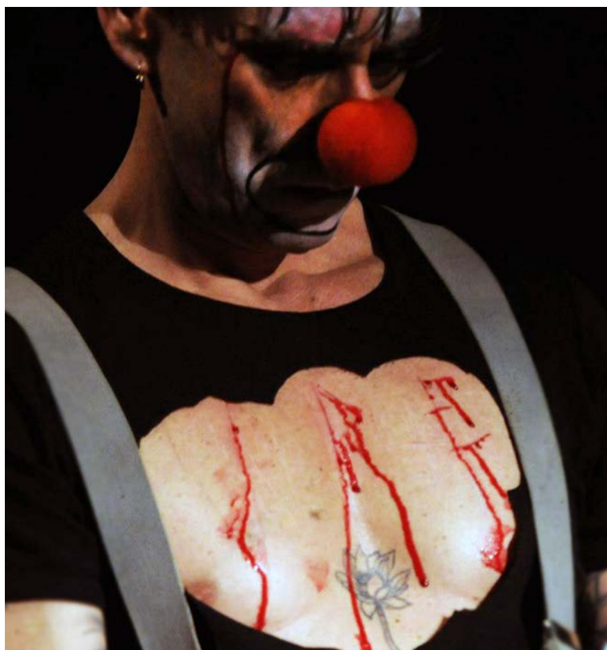
FIGURE 10 - VESTANDPAGE, THE SMILE AT THE TOP OF THE LADDER (2012). FONDERIA 900, ROME, IT

Of course, VestAndPage do not use their blood to explore elixir system and ferment system notions like the ancient alchemists, who distilled blood as liquor in alembics and ampoules to reach the very essence of the soul. Also stepping back from classic Body art, if anything they use alchemical, medical, and surgical devices to extract their blood from their bodies and ritualise it into a stream of consciousness writing, poetic words, texts, diagrams and drawings, which pertain to the specific theme of a particular performance. For them, blood is an element to produce real poetry while they perform.