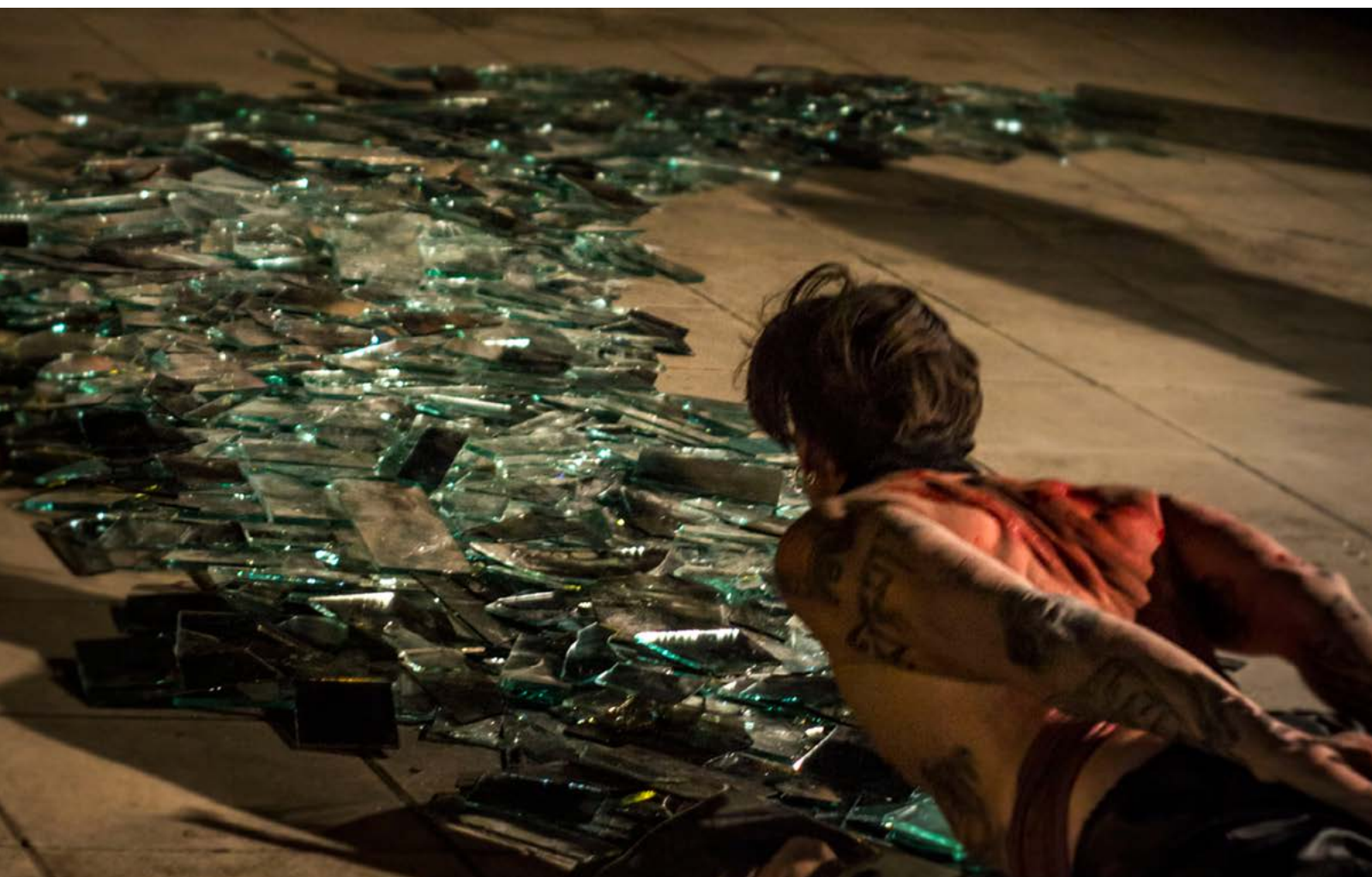
FIGURE 7 - VESTANDPAGE, AEGIS VI: HOME (2017). STATE MUSEUM OF CONTEMPORARY ART, THESSALONIKI, GR

The element of ritual appears in a wide variety of performance pieces since the earliest forms of performance art. VestAndPage's choice of ritualising the use of blood along with their iconic hazardous materials with which they perform has been long meditated to facilitate presence and intuitive responsiveness. Their repertoire of materials consists of glass and mirrors shards, as in AEGIS VI: Home (2017) (Figure 7); knives, blades, nails, barbed wire, ropes, or natural latex fabrics and strings like in HOME V: Mother (2018) (Figure 8); slippery substances, fluids, blocks of ice on which they dance or lay naked; fire drops and flames falling directly on their flesh or held in their hands until they can, like in The Smile at the Top of the Ladder (2012) (Figure 9). In their live performances, VestAndPage use these materials to set up situations that are constrictive to solicit their sensorial responsiveness and operate with full awareness in the here and now.