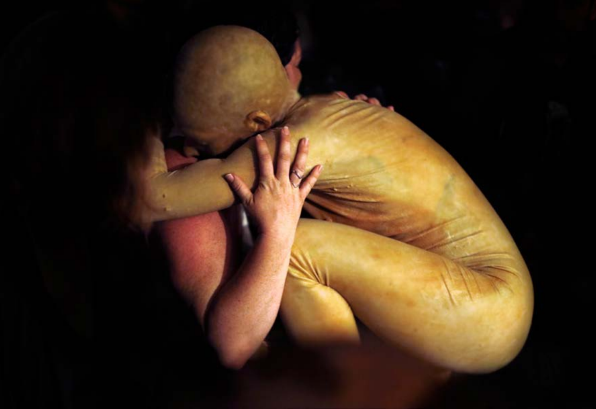
FIGURE 6 - VESTANDPAGE, AEGIS III: COURAGE (2016). GRACE EXHIBITION SPACE, NEW YORK, US

To improve perceptual ability, VestAndPage exercise a constant awareness towards what is not visible to the eyes by following specific training that they have developed from Social Theatre, Sufi Theatre, Physical Theatre practices and Dynamic Breathing techniques. For them, beyond the physical configuration of the bodies, as they appear in reality, there is a universe of invisible, subtle energies that vibrate and resonate. To feel, sense and perceive are faculties they harness to comprehend emphatically and with compassion the invisible pain and suffering of others, to voice through artistic actions that which often cannot be understood.