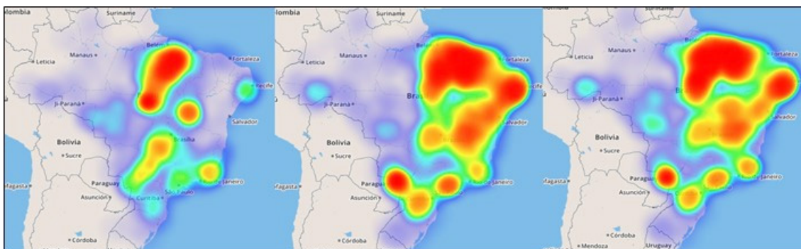
Figure 1 - Intensity of colors and measures showing location (municipality) of rescue, origin and residence of enslaved workers