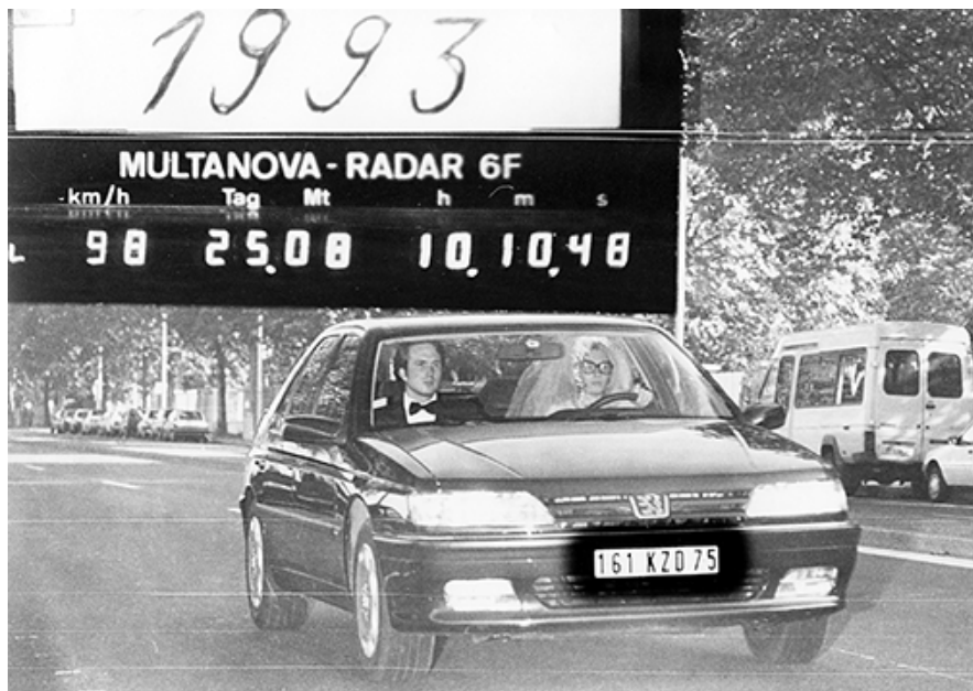
Jeff Guess - Fonce, Alphonse (1993)

As an example we can mention the work “Fonse, Alphonse” (1993), in which the North American artist Jeff Guess purposely exceed the speed limit with your car in France on the day of your wedding, so the wedding couple properly dressed for the “ceremony” is caught by a traffic control camera. With this ironic device, the artist uses a public apparatus of control to generate the record of a performance of his marriage, transformed into an ultra autobiographical performance. It is as if this action to reverse the arrow of power, where those who exercise the role of victim’s state of scrutiny mechanism is the observer, not the observed.