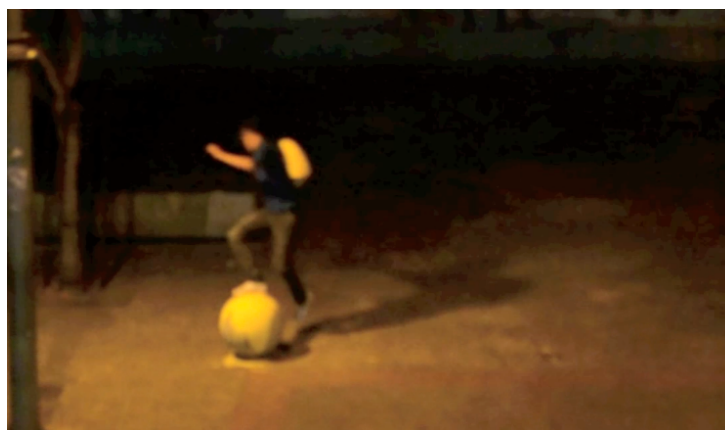
Christina Fornaciari - What do we do when no one is watching (2013)

On the other hand, the sound that the viewer gets, the headset shows these same young people narrating situations in which they were beaten, sexually abused, morally and physically by police - showing thus what the police do naturally, when no one the are seeing.