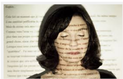
Sophie Calle – Take Care of Yourself (2007)

Take the example of work “Care for You (2007)” the French artist Sophie Calle, known precisely for inspiration in particular facts of his life. In this work, carried out over two years and documented in photographs, videos and texts, more than 100 women were invited by Sophie interpret an e-mail received by her, where her then boyfriend ended the relationship, saying goodbye with the phrase title of the work.