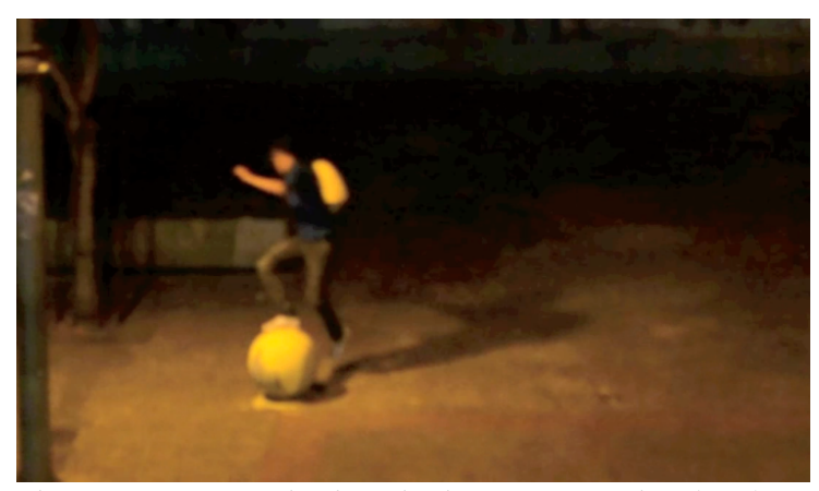
Christina Fornaciari - What do we do when no one is watching (2013)

On the other hand, the sound that the viewer gets, the headset shows these same young people narrating situations in which they were beaten, sexually abused, morally and physically by police - showing thus what the police do naturally, when no one the are seeing.