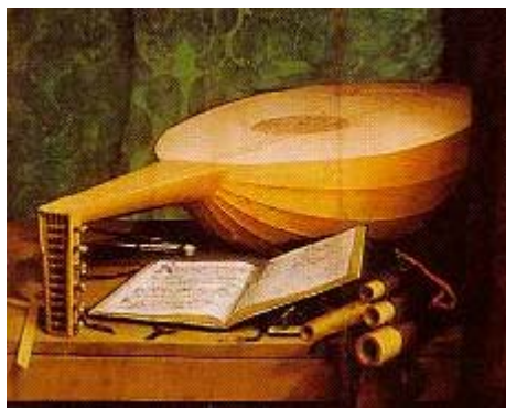
Fig. 11: Hans Holbein The Younger, The Ambassadors (detail), 1533, oil on wood, 206.0 x 209.0 cm, National Gallery, London

bishop in London during a politically crucial situation. The center of the painting is fully occupied by a shelf and objects with highly symbolic value and a skull. The broken sixth string of the depicted lute and the flute case fit into the overall narrative of Holbein's painting as does the songbook by combining two songs of the second edition of Johann Walther's Geistliches Gesangbuch (Worms, Peter Schöffler, 1525) that do not, however, appear on the opposite pages as in Holbein's depiction (fig. 11). 24