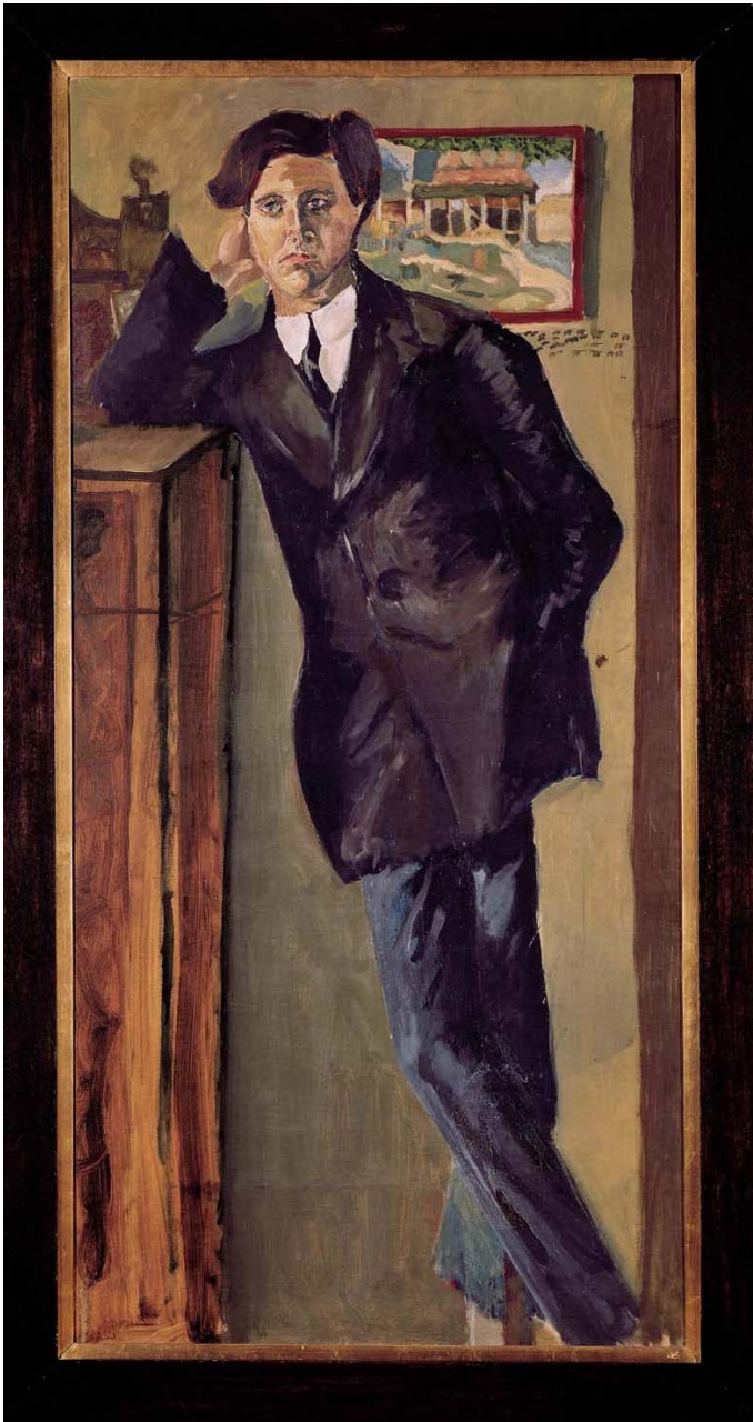
Fig. 19: Arnold Schoenberg, Alban Berg, 1910, Oil on canvas, 175,5 x 85 cm, Museen der Stadt Wien, Vienna