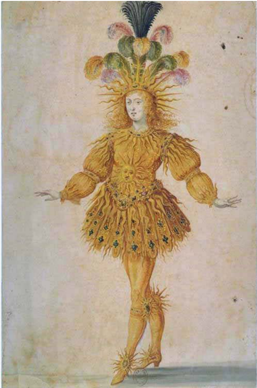
Fig. 13: Louis as Apollo, anonymous costume sketch for the performance of Ballet royal de la nuit (Paris 1654), Cabinet des Estampes, Bibliothèque Nationale, Paris