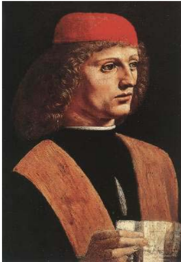
Fig. 16: Leonardo da Vinci, Portrait of a Musician, 1490, oil on panel, 43 x 31 cm, Pinacoteca Ambrosiana, Milan