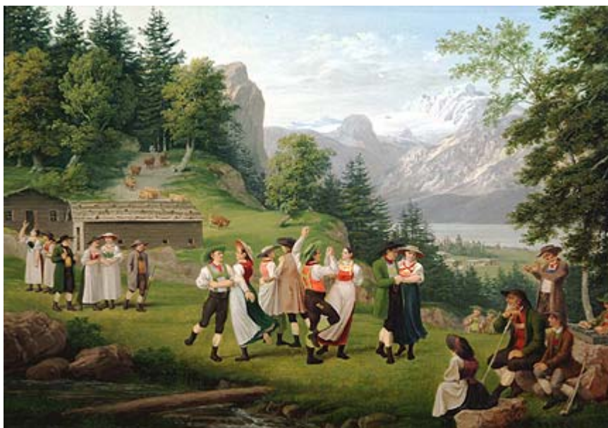
Fig. 5: Jakob Gauermann, Polsterltanz, 1820, oil on canvas, 31.0 x 45.1 cm, Private Collection