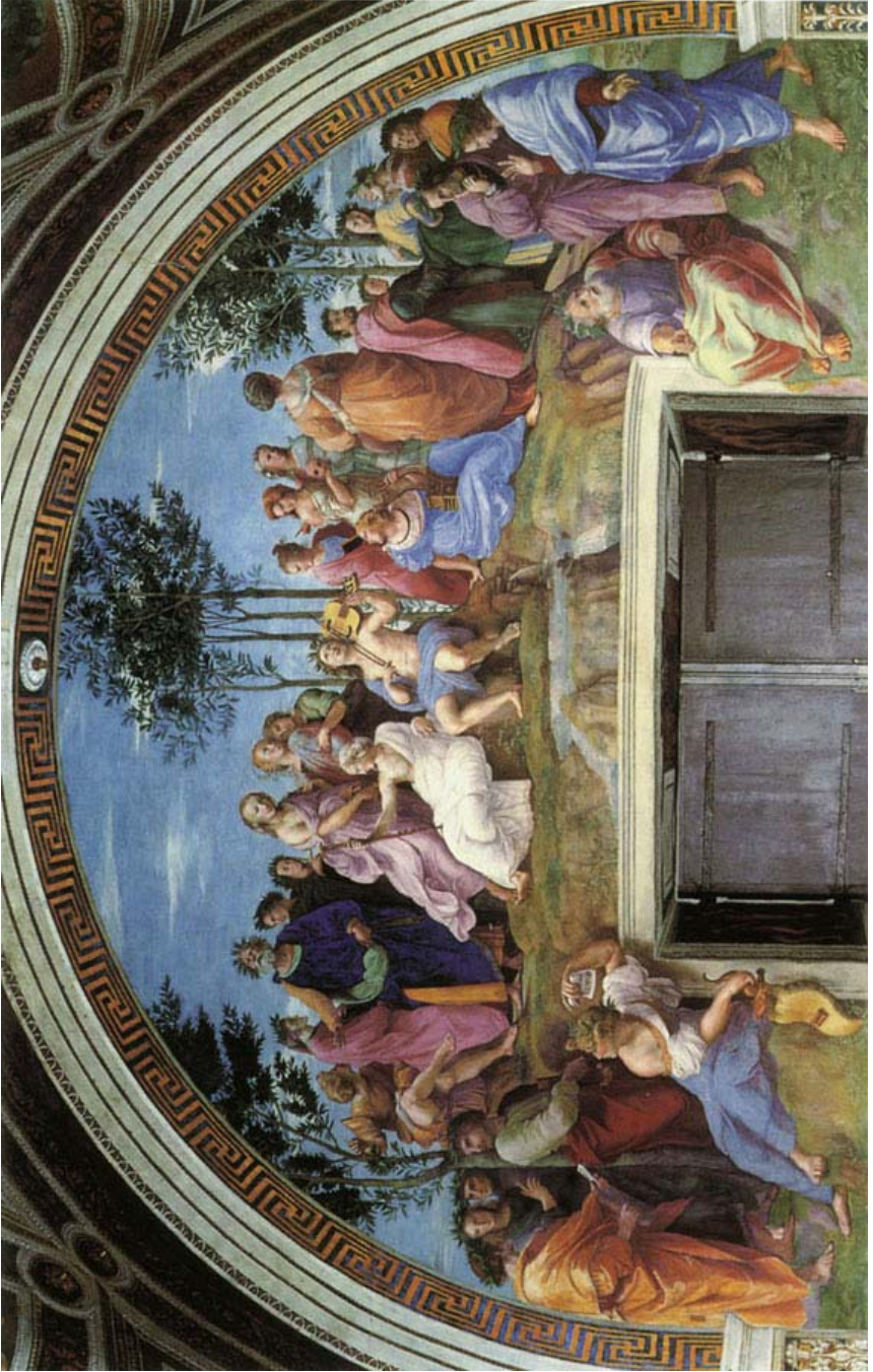
Fig. 1, Raphael (Raffaello Santi), Parnass, 1509-1511, Stanza della Segnatura, Vatican State