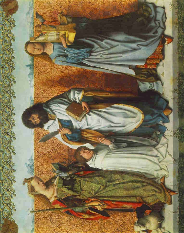
Fig. 4: Master of the Saint Bartholomew Altar, Saint Cecilia, Saint Agnes and Saint Bartholomew, 1485-1510, triptych (central panel), wood, 129 x 161 cm, Alte Pinakothek, Munich