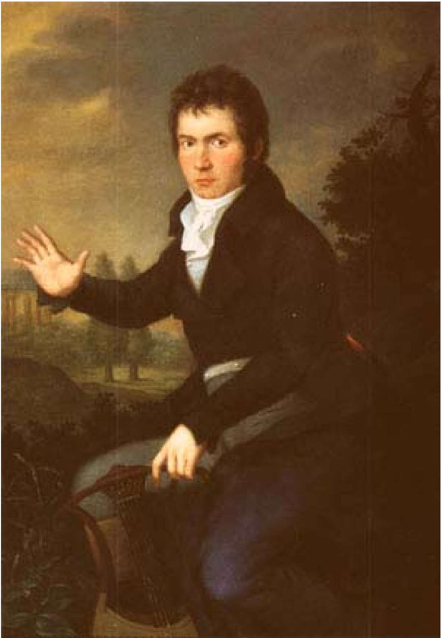
Fig. 18: Joseph Willibrod Mähler, Ludwig van Beethoven, 1804-05, Oil on canvas, Historisches Museum – Beethoven Pasqualatihaus, Vienna