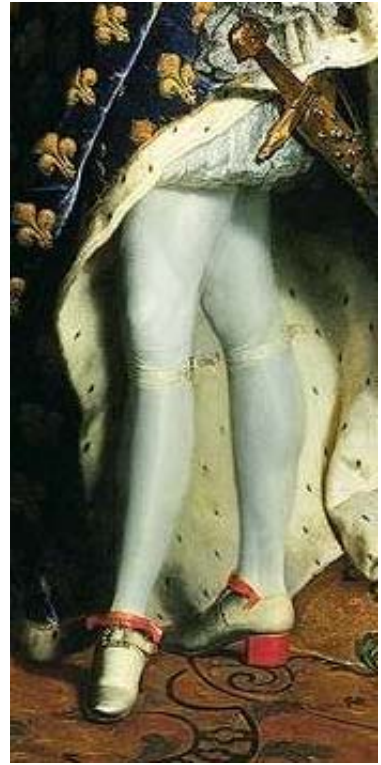
Fig. 15: Hyacinthe Rigaud, Louis XIV, (detail), 1701, Oil on canvas, 279 x 190 cm, Musée du Louvre, Paris

from presenting a musician or composer as a person involved in serious activities as I have discussed in my forthcoming paper Mapping music iconography . 36