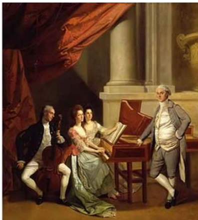
Fig. 7: Johann Zoffany, The Morse and Cator Family, ca. 1783/84, 110.2 x 100.1 cm, Aberdeen Art Gallery and Museum

stands on the right. Zoffany's painting depicts a typical eighteenth century musical gathering as he has provided in a very similar way in his painting George, 3 rd Earl Cowper, with the Family of Charles Gore in ca. 1775 (fig. 8).