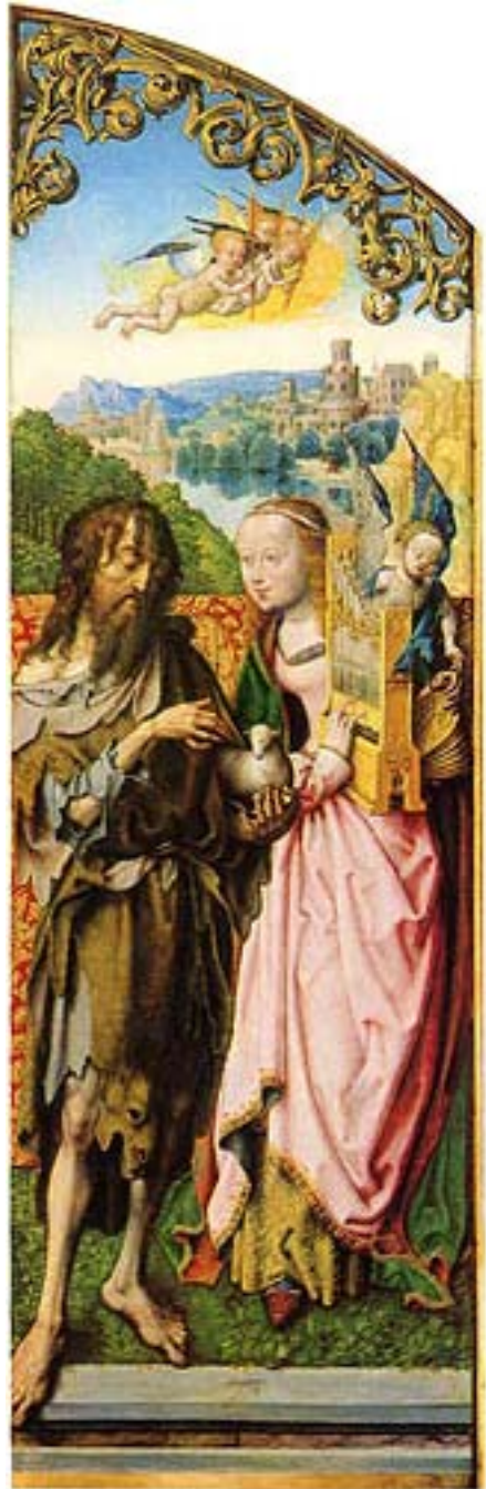
Fig. 2: Master of the Saint Bartholomew Altar, Saint John the Baptist and Saint Cecilia, Kreuz Altar, left wing, about 1490-1495, Wallraf-Richartz-Museum, Cologne