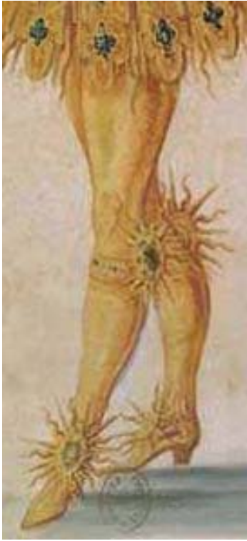
Fig. 14: Louis as Apollo (detail), anonymous costume sketch for the performance of Lully's Ballet royal de la nuit (Paris 1654), Cabinet des Estampes, Bibliothèque Nationale, Paris