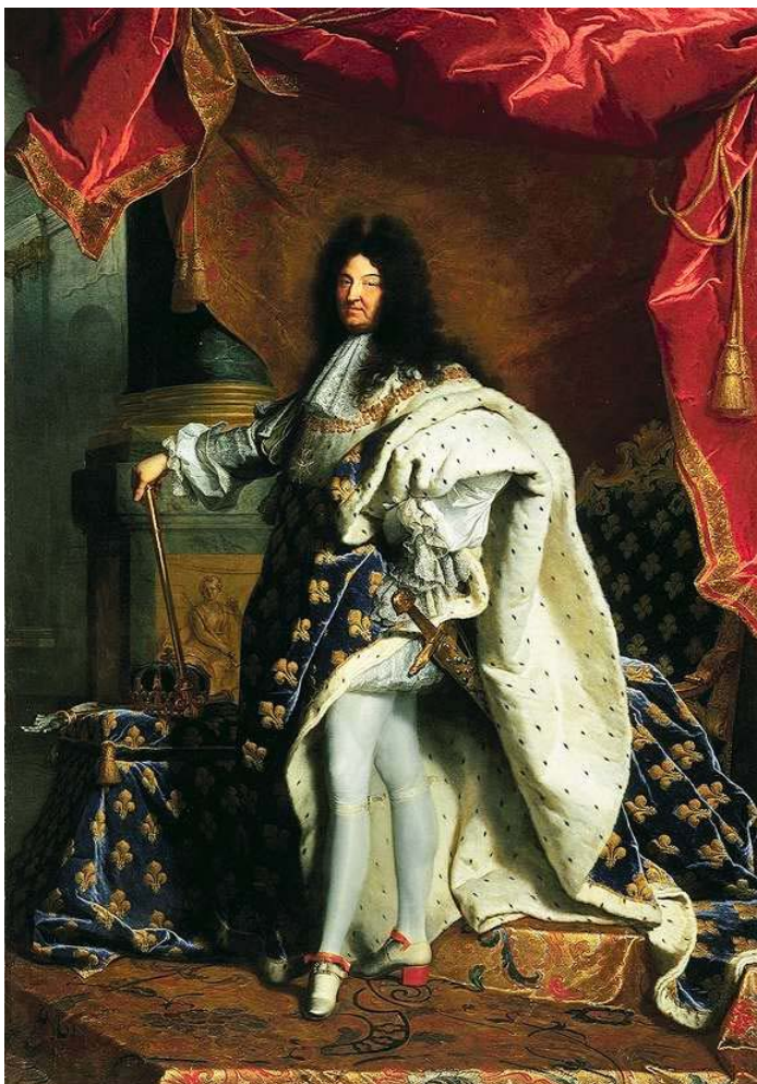
Fig. 12: Hyacinthe Rigaud, Louis XIV, (detail), 1701, Oil on canvas, 279 x 190 cm, Musée du Louvre, Paris

Another interesting example of the benefits of cross-fertilization is the famous portrait of Louis XIV, the Sun King, painted by Hyacinthe Rigaud (fig. 12) which initially may not even appear to be concerned with music.