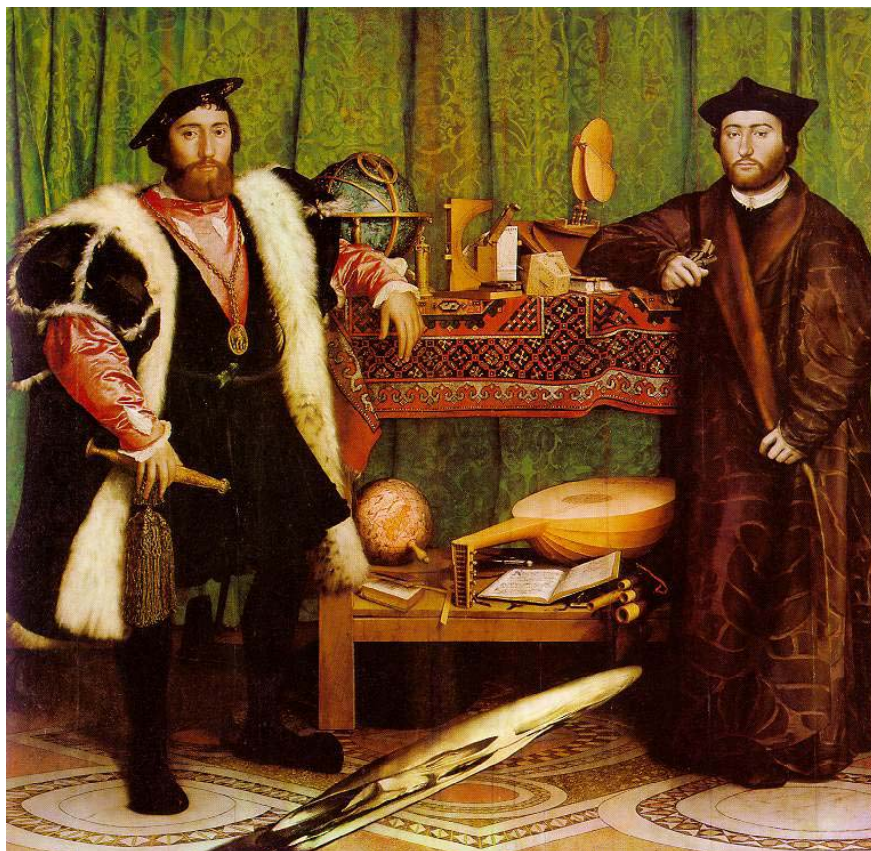
Fig. 10: Hans Holbein The Younger, The Ambassadors , 1533, oil on wood, 206.0 x. 209.0 cm, National Gallery, London

Holbein's canvas is a double-portrait of Jean de Dinteville (left), who became French ambassador to the English court of Henry VIII in 1533, and Georges de Selve (right), bishop of Lavaur, and depicts the visit of the