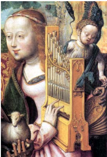
Fig. 3: Master of the Saint Bartholomew Altar, Saint John the Baptist and Saint Cecilia, Kreuz Altar, left wing (detail), about 1490-1495, Wallraf-Richartz-Museum, Cologne