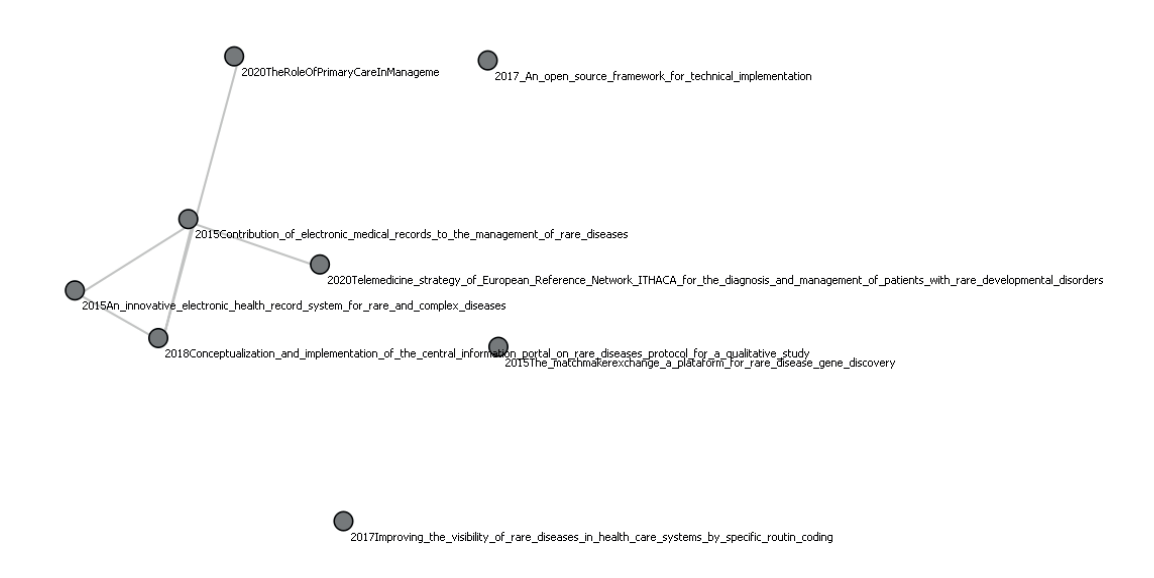
Figure 3 – Multidimensional scaling to adjust the distance between articles