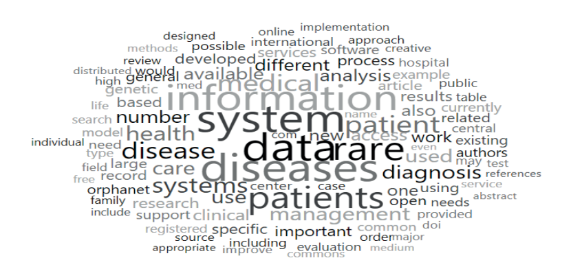
Figure 2 – Frequency of the most cited words in the articles

The result of the frequency of words, shown in Figure 2, indicates that the main discussions on the topic are directed towards computer tools, which refer to data and information systems. The words disease and rare are also frequent. Words related to patient care, such as medication, management, and diagnosis, are also frequent.