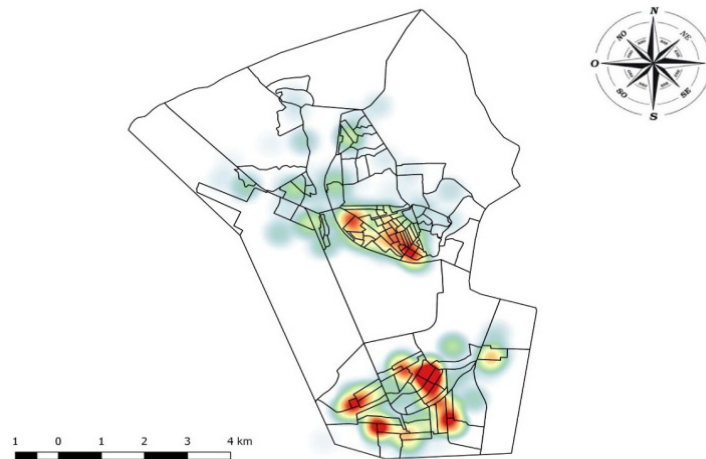
Figure 2 – Spatial clusters of new cases of leprosy residing in the city Paulo Afonso