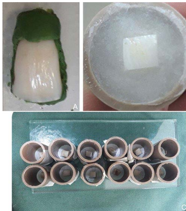
Figure 1(A-C) – A Tooth slide immersed in thermoplastic modelling plastic impression compound; B Bovine tooth fragment with 6mm 2 standard size; C Polyvinylacrylic used as forms.

The mounted specimens were randomly divided into four groups according to the type of curing light and polymerization times as follows: