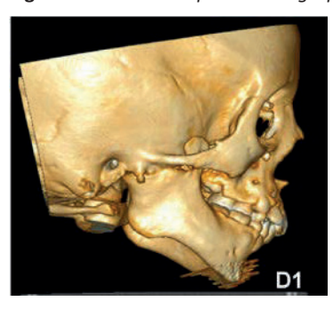
Figure 1 D1 – 3D Computed tomographic lateral