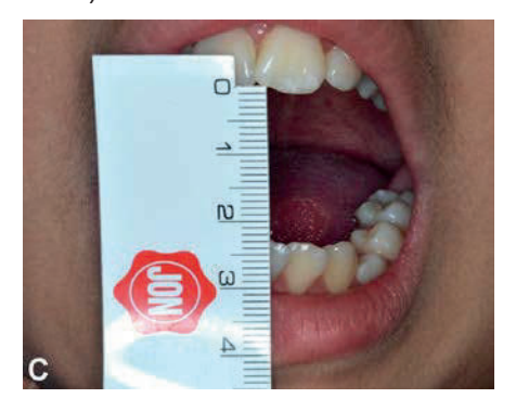
Figure 2C – Clinical aspect 7 months after surgery (mouth open 25mm)