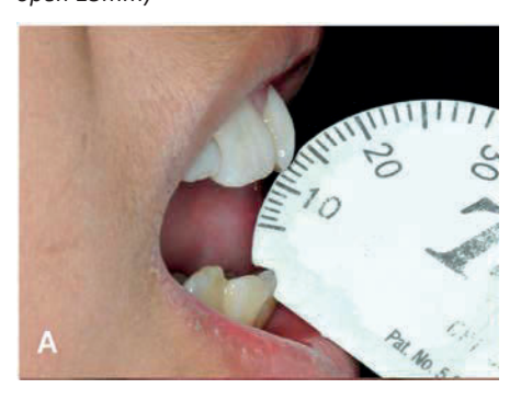
Figure 2A and B – Mouth opening 7 days post-operative (mouth open 13mm)