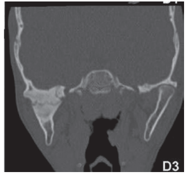
Figure 1 D3 – 3D Computed tomographic coronal