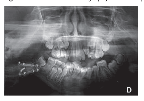
Figure 2D – Panoramic radiography 7 mouths post-operative