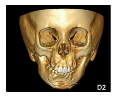
Figure 1 D2 – 3D Computed tomographic front