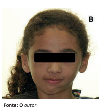
Figure 1 A – Physical aspect (showing lowest weight)

Figure 1B - Asymemetric facial expression