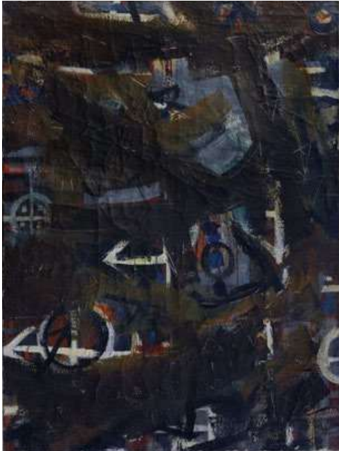
Ill. 5. Peinture, 1965-1967, oil on canvas, 130 x 97 cms