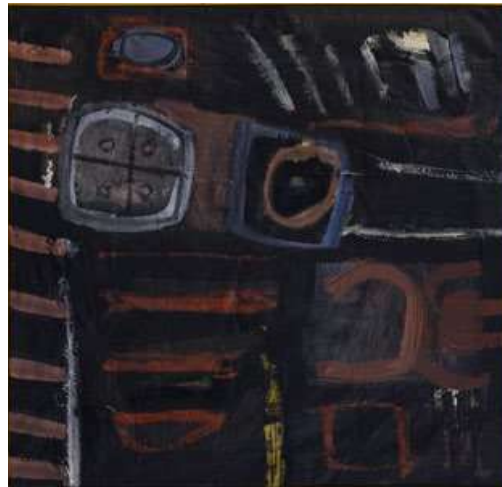
Ill 8. Pintura Negra , 1968-1970, oil on canvas, 115 x 120 cms

Identity. Primitivism / The Demoiselles deframed.