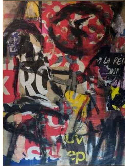
Ill. 6. Collage Painting, 1991, 130 x 97 cms

Layers. Transparency / Opacity / Appearing, disappearing (→ Memory, etc.) / Overwriting. Confrontation/ Entanglement / Scrutinizing readability.