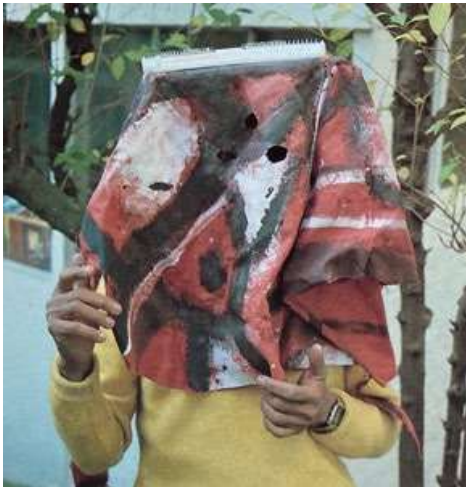
Ill. 7. Ancestral . For Masques d'artistes exhibition, Salons Malmaison 1987.