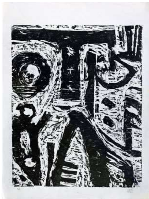
Ill. 3. Untitled, 1977, woodcut, E/A, 84 x 66 cms

The threshold -the matrix - fading. Memory / Fragility / Elusiveness