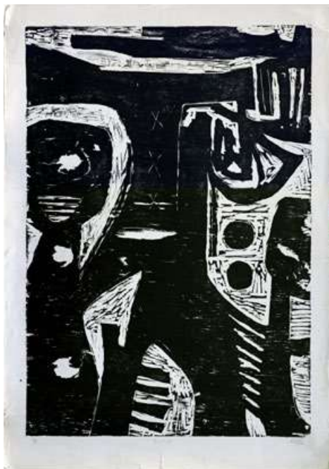
Ill. 2. Umbral , 1977, woodcut, 93 x 66 cms